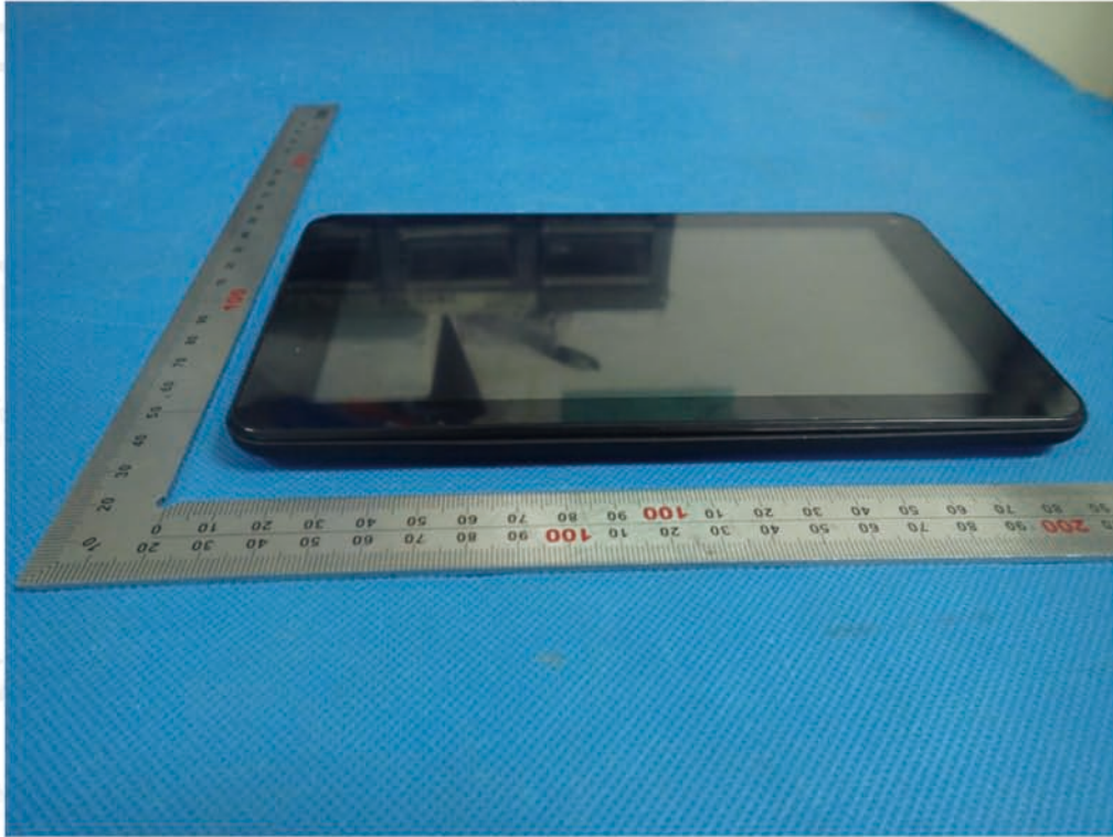
OPEN VIEW OF EUT-1